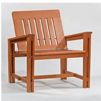
BY JOHN BRUHL

Open to all levels, this movement class will be a practical and thought-provoking dance experience combining ideas and methods from modern dance, including improvisation.